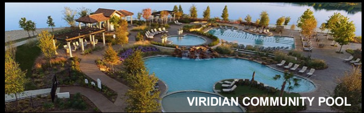
VIRIDIAN COMMUNITY POOL